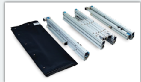
Parts fold completely for fast and easy transport.