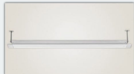
39" threaded rod (M10 - 1.5mm) included for standard in-ceiling installation.