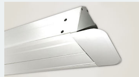
Deluxe In-Ceiling Series retracts neatly into the case while not in use.

Note: The most common sizes and aspect ratios are listed here. Visit severtsonscreens.com/model/DSE or contact a sales representative for more available sizes and specifications.