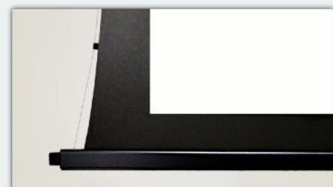
The tension setting can easily be adjusted to maintain perfect viewing tension.