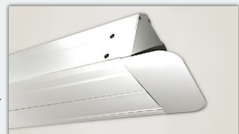
Deluxe In-Ceiling Series retracts neatly into the case while not in use.

Note: The most common sizes and aspect ratios are listed here. Visit severtsonscreens.com/model/DST or contact a sales representative for more available sizes and specifications.